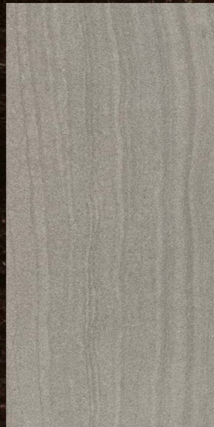
Size 30x60 cm