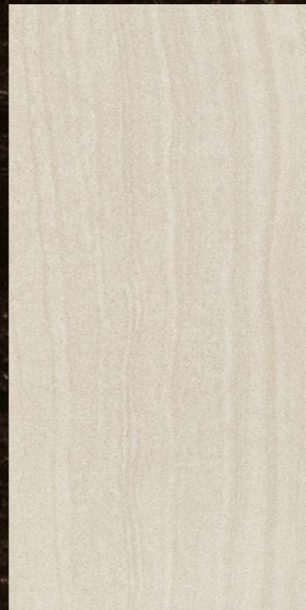
Size 30x60 cm