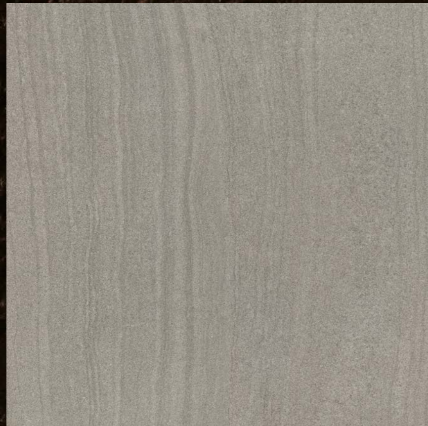
Size 60x60 cm