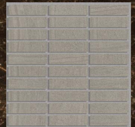
Linear bricks 3x10 cm

Bering Grey natural finish code: IN-BG-N Bering Grey lappato finish code: IN-BG-LP