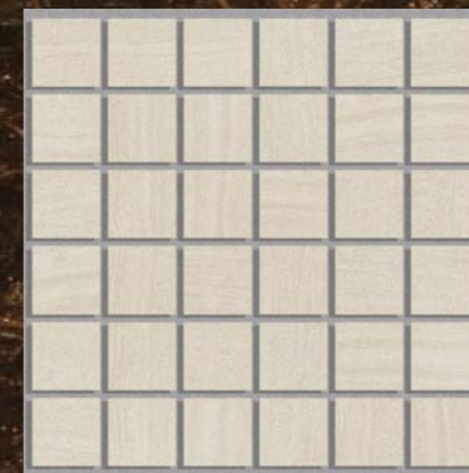
Square 5x5 cm