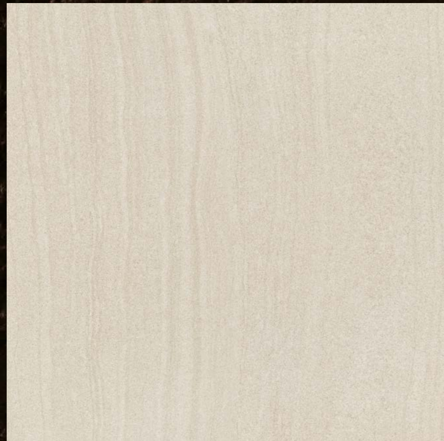
Size 60x60 cm