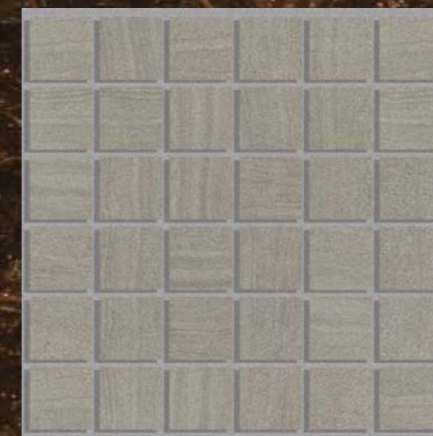
Square 5x5 cm