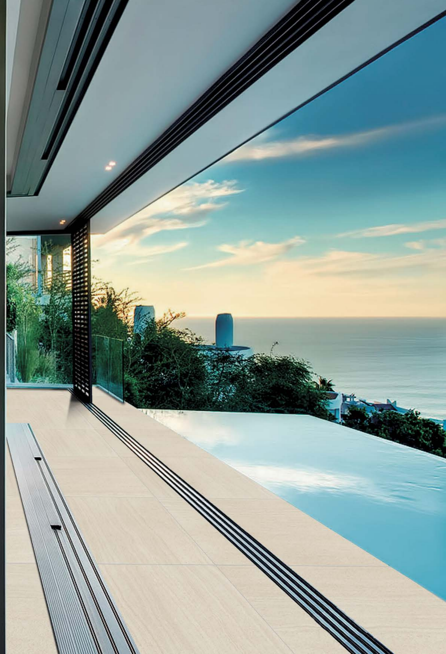
floor shown INEVITABLE 60x60 ARCTIC WHITE